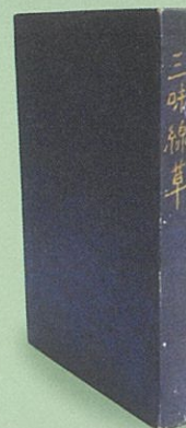
Shamisen-gusa : Series of Illustrated Books of Kouta Songs (Shinchōsha, 1915) Takehisa Yumeji, Author & Book Design