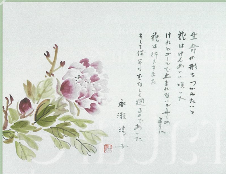
Poem and Art Nagase Kiyoko